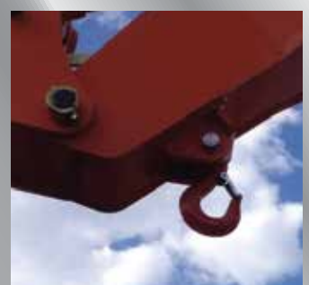
Boom Lift Point